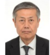
Hon. Yoshiaki Miawa Consul General of Japanese Consulate Office in Davao City