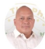
October 27, 2020 HON. RONALD DELA ROSA Senator of the Philippines Topic: Anti terrorism Law